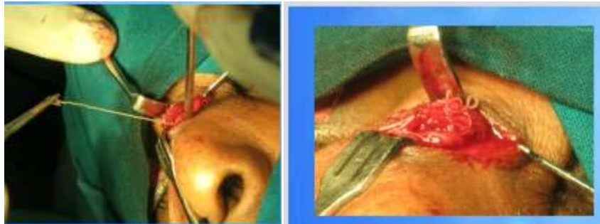
Fig 4 .Mass mass with larva

The cyst was cut open which revealed the larva.