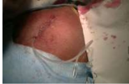
Fig 6.Suction drain and wound closure

Regular small sized suction drain was inserted and wound closed with 3,0 prolene .