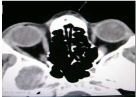
Fig 2. Swelling with encysted larva on ct pns

These cases were diagnosed with standard investigations and treated by surgical excision.