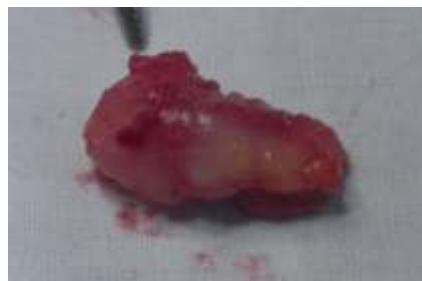
Fig 5. Cyst in toto

Mass removed in toto from the surface of the underlying muscle.