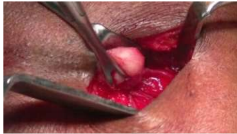
Fig 3. Encysted mass on dissection .

Local anesthesia was used at the site. Incision made over the swelling and blunt dissection done to identify the mass